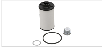
097.370 Audi, Seat, Skoda, VW