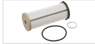
166.040 Audi, Seat, Skoda, VW