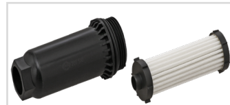
203.510 Citroën, Mitsubishi Peugeot, Volvo Ford, Renault Morgan