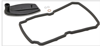
482.400 Mercedes-Benz, Maybach Jeep, Lancia Dodge, Chrysler