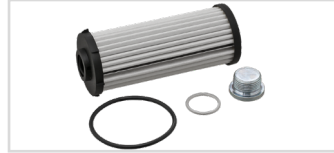
097.410 Audi, VW